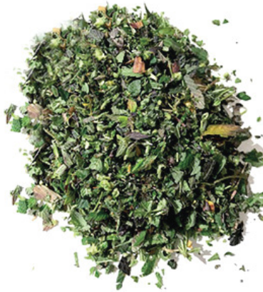
With Trim Saver w/ Trim Saver