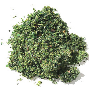
Without Trim Saver w/o Trim Saver

Maximize Profit Without Wasting Your Trim